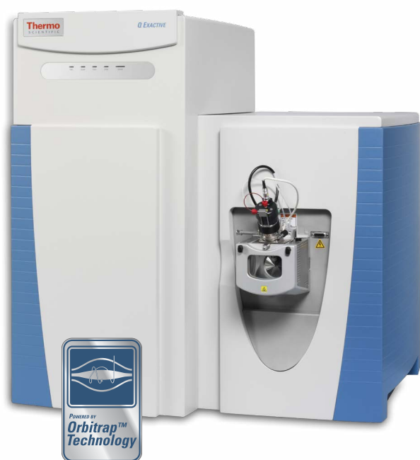
Thermo Scientific Q Exactive MS system.

The Q Exactive benchtop LC-MS/MS combines high-performance quadrupole precursor selection with high-resolution, accurate-mass (HR/AM) Orbitrap detection to deliver high performance and tremendous versatility.