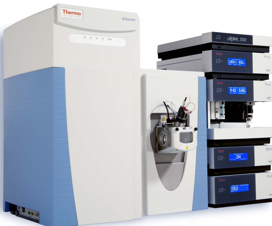
The Thermo Scientific Q Exactive™ mass spectrometer with the Thermo Scientific Ultimate 3000 RSLC.