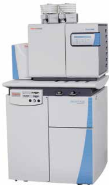
Figure 1. The Thermo Scientific EA IsoLink IRMS System.

Sugar cane and corn syrups, the most widely used adulterants, have distinctive isotopic ^{13}\text{C} signatures because both sugar cane and corn plants use the C4 photosynthetic pathway in contrast to most honey which is derived from plants that use the C3 photosynthetic pathway. These differences in ^{13}\text{C} isotopic composition allow detection of > 7% addition of such sugars. 2 Stable isotope analysis of honey, in order to detect adulteration is in widespread use and can be undertaken with an EA-IRMS System, such as the Thermo Scientific™ EA IsoLink™ IRMS System (Figure 1).